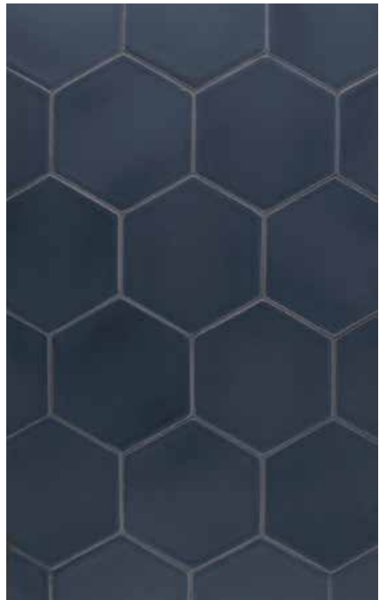
G1-122 Portland 5" Hex-C340