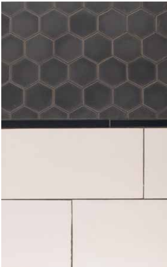
G1-121 Portland 2" Hex-C86, Portland 5x10-PUWM