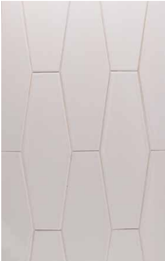
G1-117 Portland Lg. Elongated Hex-R15