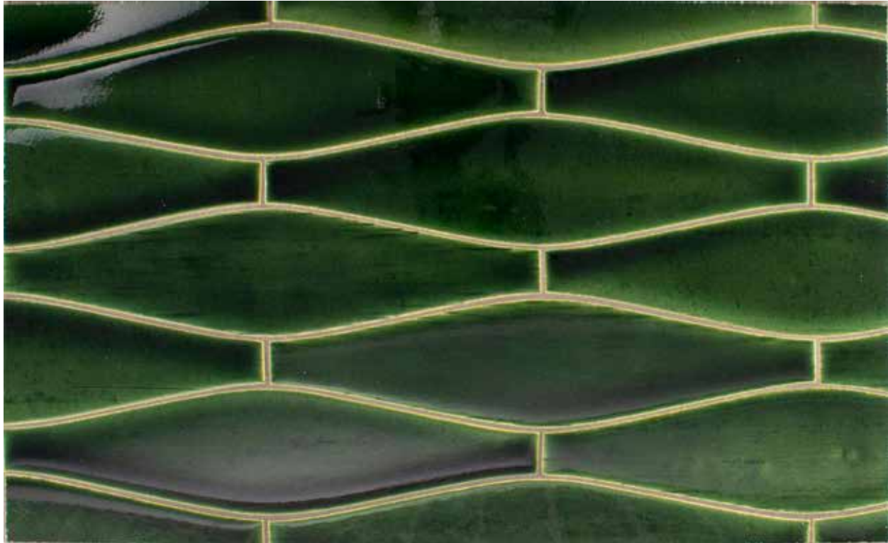
G1-114 Portland Lg. Elongated Ogee RC210

We're pleased to introduce the Portland field option to our tile offering! Both the surface and edge of Portland field tile reveal the unique markings acquired through the handmade production process. These characteristic traits are what make Portland field so appealing and beautiful.