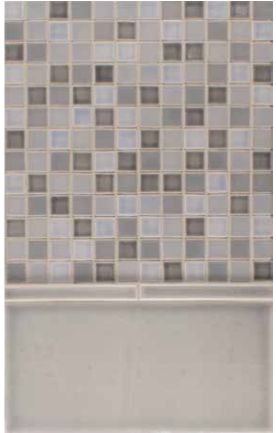
G1-120 Portland 1x1-R342, R355, C56, C57, Portland 6x12-W92