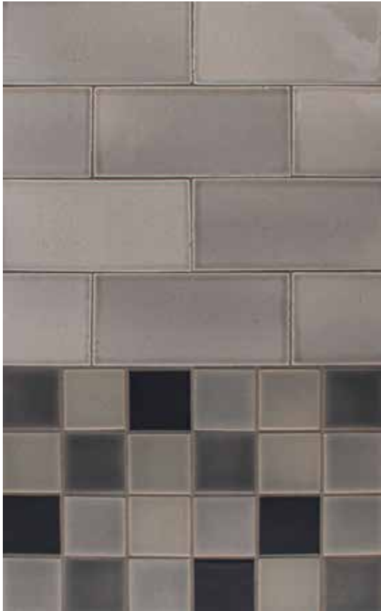
G1-119 Portland 3x6-R342, Portland 2x2-C45, C53, C59, C86