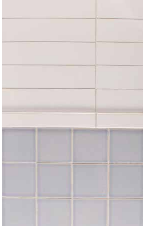
G1-116 Portland 2x8-UW, Portland 3x3-R355